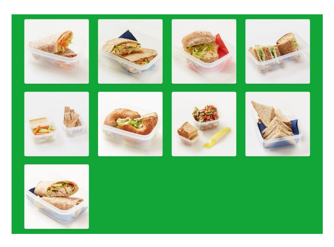
Add some fruit or salad